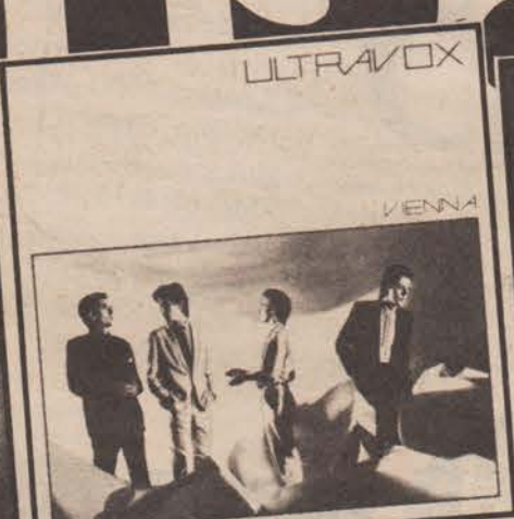
Ultravox: Vienna Album: £4.29 Cassette: £4.49