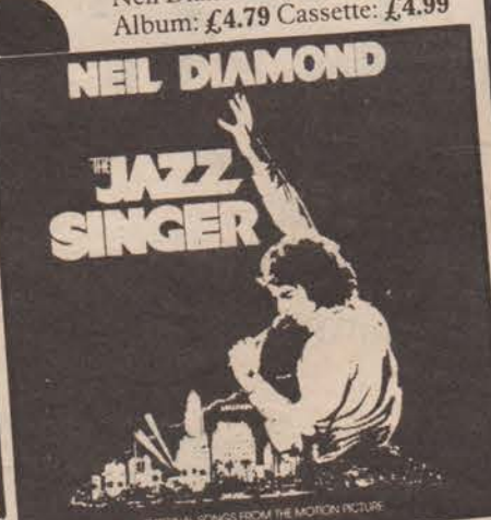
Neil Diamond: Jazz Singer Album: £4.79 Cassette: £4.99